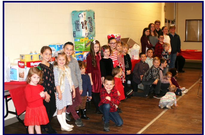
Junior members assisted representatives of the Tulare Lighthouse Mission load donations from Roma Lodge Members at the Christmas Party!