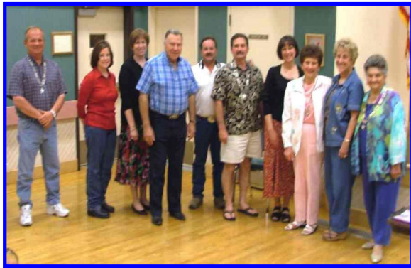
50 year members getting their 35th year pins 15 years ago!

To begin with we have a record number of members who are celebrating their 50th year of membership. As shown on the first page we have a record number of 10, yes 10, members who are celebrating 50 years of membership in Roma Lodge!