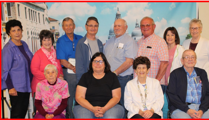
50+ Year Members of Roma Lodge!

On May 1st, Roma Lodge will be celebrating our 93rd Anniversary. As part of our celebration we will