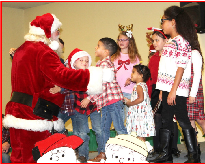
Juniors greet Santa!

If you were one of the over 100 members and guests who attended the 95th Roma Lodge Christmas party you were treated to an outstanding ribeye steak meal, wonderful decorations, a great talent show by our juniors and a